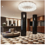
› The Frankfurt Hotel