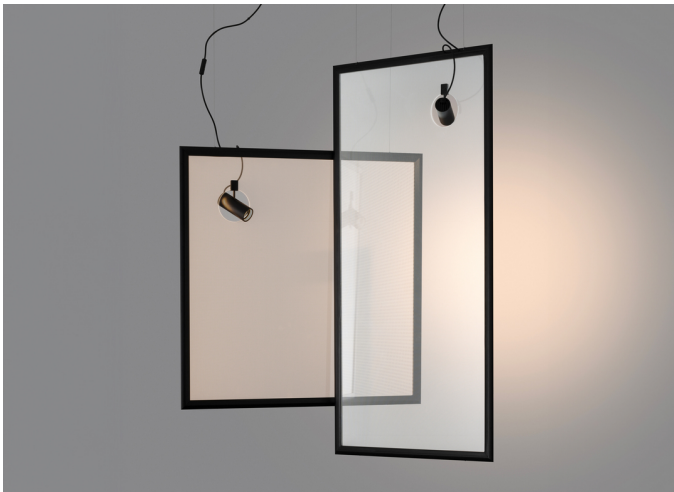
Discovery Space Spot - Ernesto Gismondi

The patented Discovery technology creates an element that doesn't invade the environment, totally absent and dematerialised when switched off, it gains volume when switched on thanks to the light that draws the central emitting surface. These generate a precise and punctual light extraction according to a flow balance with respect to the emitting surface that guarantees perfect visual comfort, an enveloping and constant light on both sides.